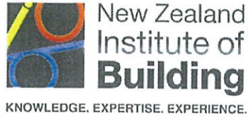
New Zealand Institute of Building